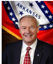
Gov. Asa Hutchinson